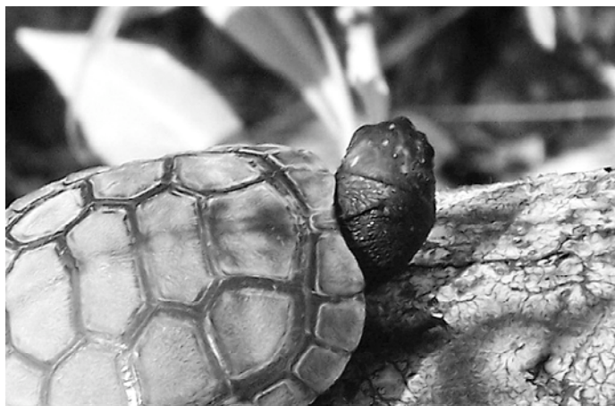
Hatchling baby spotted turtle